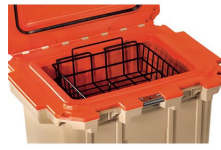
30-WB Dry Rack Basket