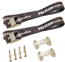
TDKIT Tie Down Kit