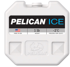
PI-1LB 1lb Ice Pack