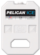
PI-2LB 2lb Ice Pack