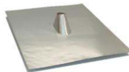
2.0 ALUM. CONE FLASHING